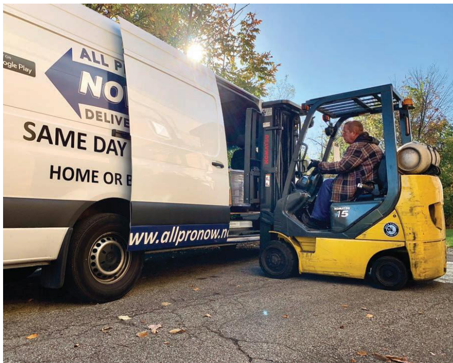
A forklift operator at Komar Screw Corp. in Brecksville pulls a loaded pallet out of an All Pro Now Sprinter van.

But All Pro Now is trying to stand out by piggybacking on a well-known brand and touting its tech-