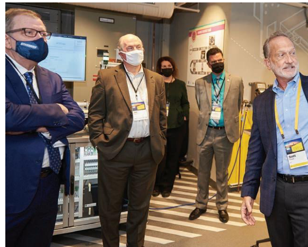
Attendees at the ribbon cutting for the EY-Innovation Hub at Nottingham Spirk listen to a presentation.

The displays receive real-time information from sensors located throughout the device; everything from the mechanical performance, temperature, energy usage and even weather conditions are captured, displayed and processed. Each machine's specific data is aggregated