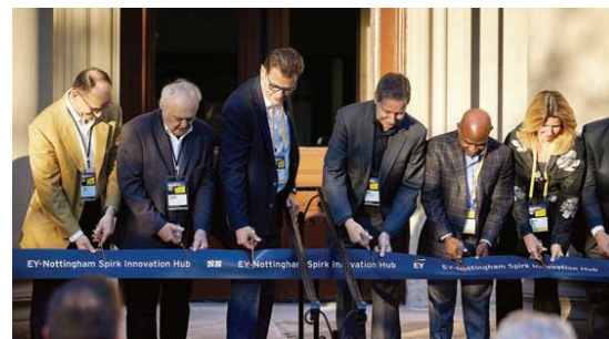
Representatives from Ernst & Young and Nottingham Spirk cut the ribbon officially opening the joint Innovation Hub on Tuesday in Cleveland.